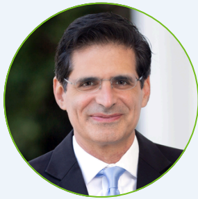
Senator Josh Becker Senate District 13