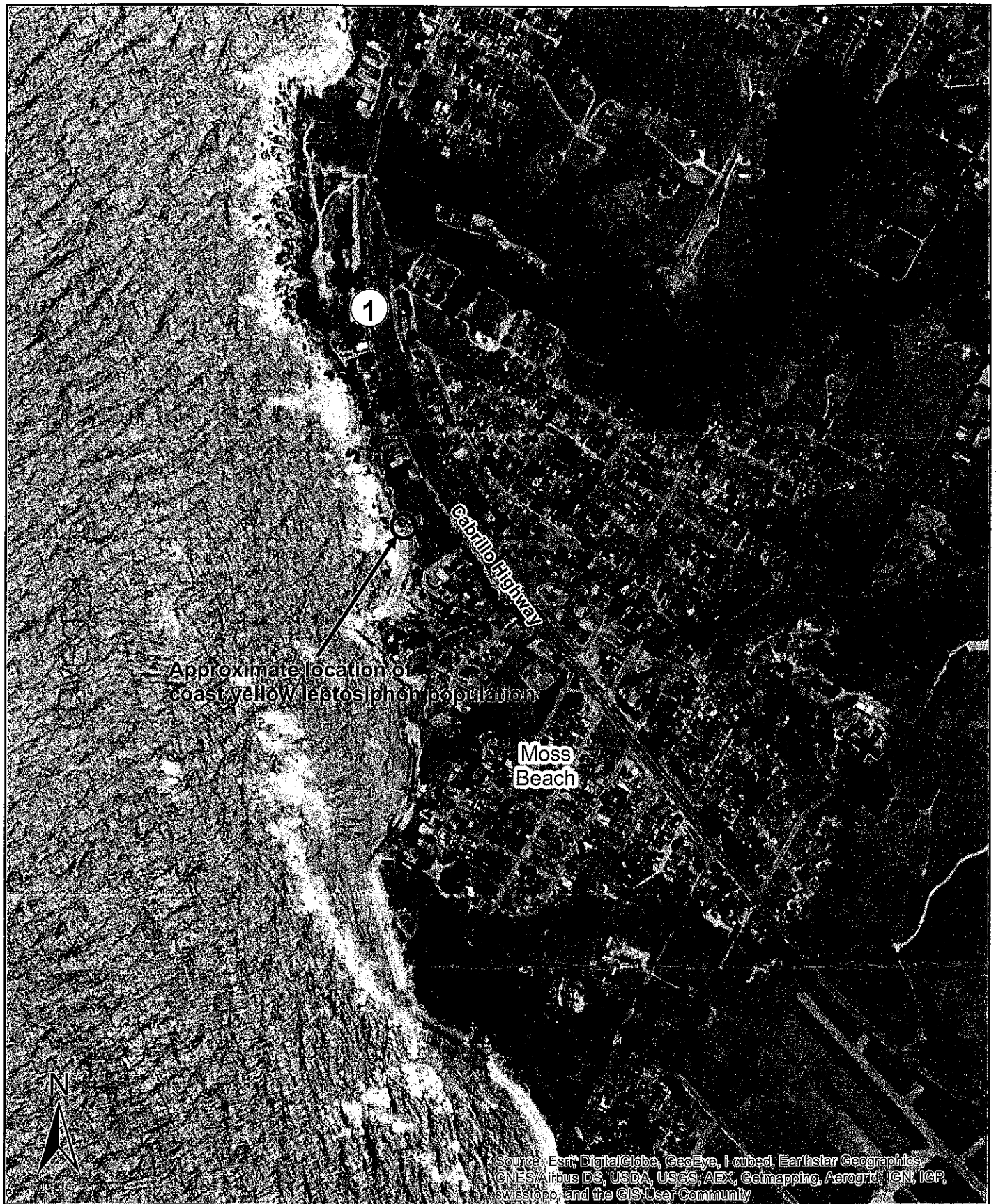
Figure 1. Coast Yellow Leptosiphon Population Moss Beach, San Mateo County